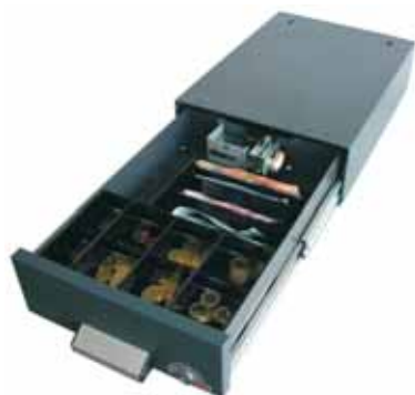
SU 28, under-counter, with 8 coin compartments and 4 sloping note compartments