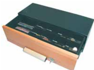
ZA 55, counter-top, front panel in beech

A cylinder lock is often sufficient as the only security element in rooms and shops which are monitored and protected by electronic systems and other security equipment.