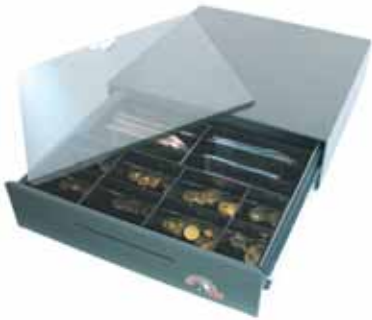
DA Euro-Cash 2002, counter-top design with removable insert KE EC and lockable cover D EC