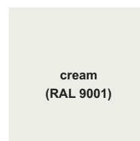
cream (RAL 9001)

The front panels of the series S and Z are also available with beech finish in the built-in version.