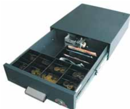
SU 35, under-counter, with 8 coin compartments and 4 sloping note compartments

The German Employers' Liability Insurance Association for Administration and Office Workers (VBG) has certified that the security alarm drawers from Mogler comply in all respects with the requirements of the German Accident Prevention Regulations (UVV) for amusement arcades and casinos with respect to secure cash tills.