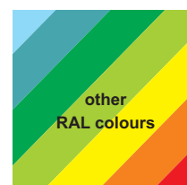
other RAL colours