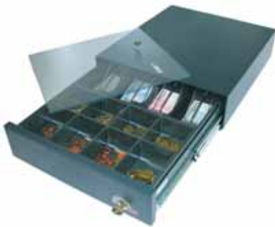
DA 37-KE, counter-top design with removable insert KE 84 and lockable cover D 84-2