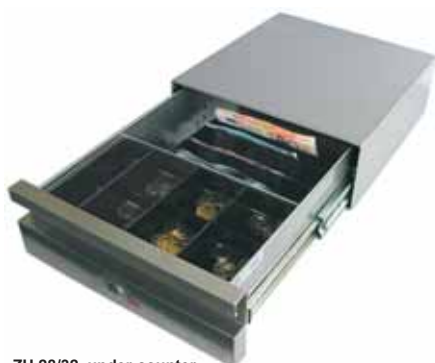
ZU 28/32, under-counter, with 8 coin compartments and 4 sloping note compartments, designed fully in stainless steel