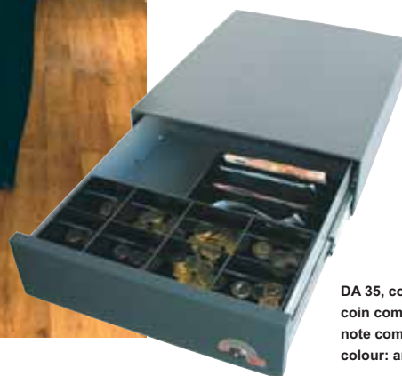
DA 35, counter-top design, with 8 coin compartments and 4 sloping note compartments, colour: anthracite