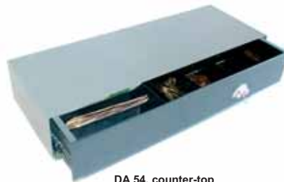
DA 54, counter-top

Series DU = (under-counter) has the same dimensions as the series DA