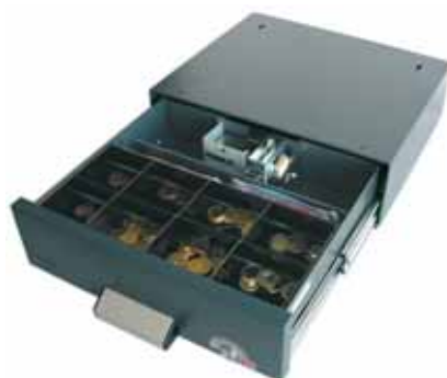
SU 35/30, under-counter, with 8 coin compartments and 2 sloping note compartments