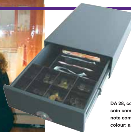
DA 28, counter-top design, with 8 coin compartments and 4 sloping note compartments, colour: anthracite