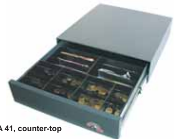
DA 41, counter-top