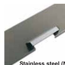
Stainless steel (N)