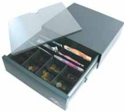
DA 35/33-KE, counter-top design with removable insert KE-35 and lockable cover D 35

Pressure locks are the fastest and easiest way of opening and closing the drawer. The drawer is opened by simply pressing the front panel. It is closed by pressing again. A cylinder lock fitted as standard provides security. Cash drawers with pressure lock are normally installed on or